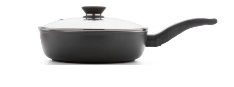
iCook™ 9.5-inch Nonstick Frypan with Lid Item # 124694E – Retail $200