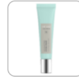
Artistry Skin Nutrition™ Hydrating Eye Gel Cream