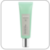
Artistry Skin Nutrition™ Balancing Matte Gel Lotion