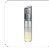
Artistry Signature Select™ Personalized Serum Base