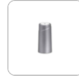
Artistry Signature Select™ Anti-Spot Amplifier