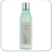
Artistry Skin Nutrition™ Balancing Fresh Shake Toner