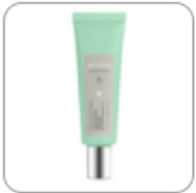
Artistry Skin Nutrition™ Balancing Matte Day Lotion SPF 30