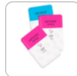
Artistry Studio™ Every Day I'm Bubblin' Cleanser + Skin Invigorator