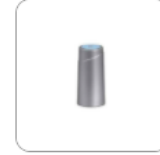
Artistry Signature Select™ Brightening Amplifier