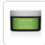
Artistry Signature Select Hydrating Mask