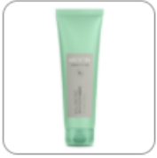
Artistry Skin Nutrition™ Balancing Jelly Cleanser